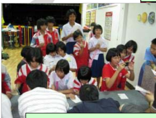
ELC kids lining up for autographs from visiting missions team.