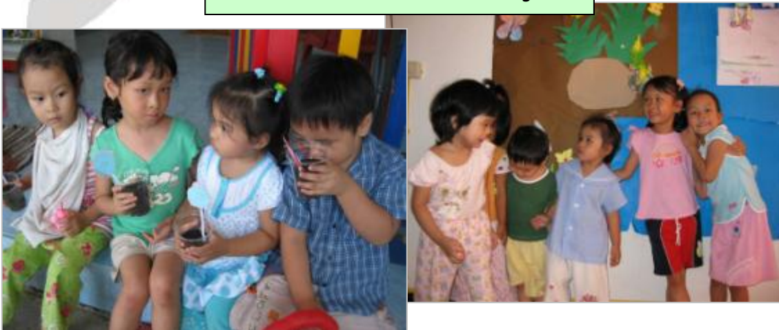
Children at the Little Candles Kindergarten