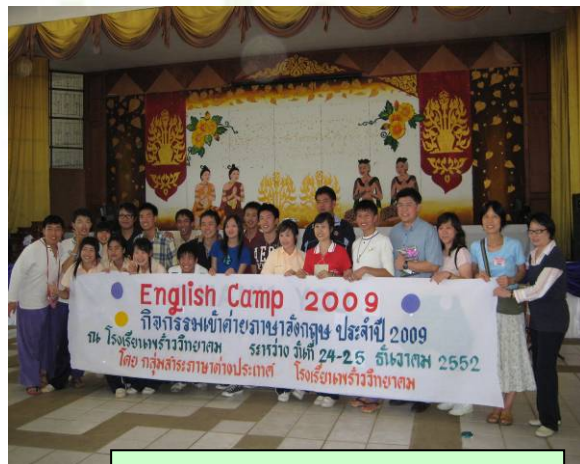
CCCV Team with Phrao HS Students

The year 2009 ended with a visit from CCCV church mission team from Melbourne, Australia (22nd dec – 1st Jan). The team supported the Phrao ministry by running an English camp at the Phrao High School. They also helped to prepare our ELC children to perform a nativity play at its annual community Christmas concert. After a slow start almost 150 people attended the concert and got to see various presentations on the true meaning of Christmas. The team won the hearts of the audience (and the "screams" of their high school fan club) for their rendition of the "Heart" drama – which portrays a character receiving a new heart from Christ after being broken many times by others. The team had also prepared over 200 Christmas gifts that were given out on the night and at various boarding houses and children's homes around Phrao. Before departing, they helped to lay the foundations for an outdoor playground for the Little Candles Nursery. Overall it was a blessed time for both our family and the ten team members.