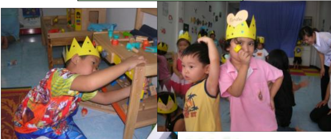
Children at the Saturday Playgroup Program

A Saturday playgroup was run from January to July 2009 from 10-11 am every Saturday program. The program was conducted free-of-charge as a community based program. It was highly successful and at one stage attracted up to 20 students each time it ran. The outbreak of H1N1 however forced the program to end in July. The program was not reopened, but replaced by the Little Candles Nursery Program.