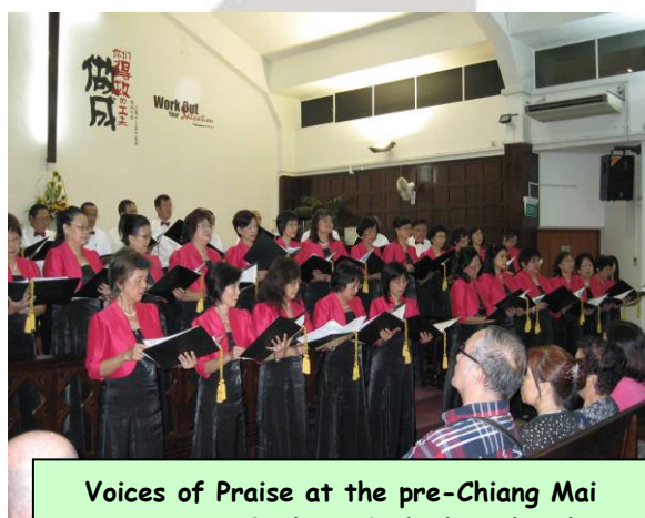
Voices of Praise at the pre-Chiang Mai concert at Geylang Methodist Church (Singapore).